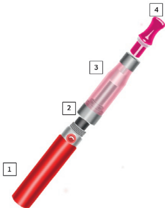
Figure 1. Structure of an e-cigarette. E-cigarettes have some basic components as shown, although new generations have changed considerably the shape. Most current models differ considerably from a cigarette. 1: Battery: usually rechargeable, and as other batteries with the possibility of leaks and explosions. 2: Heating coil: amount of vapor depends on temperature, and new devices can modify it. 3: Vaporizing chamber: includes a wick in touch with e-liquid, with different flavors and nicotine content. 4: Mouthpiece.

The first commercially available e-cigs device was developed in China, in 2003, as an alternative to smoking in places where smoking regular cigarettes were prohibited 3,4 . It was named Ruyan, a Chinese word for “resembling smoking,” and unlike nicotine patches, gum or lozenges it was not designed as a pharmacologic tool for smoking cessation but to deliver “enjoyable” nicotine and overcome regulations 5 .